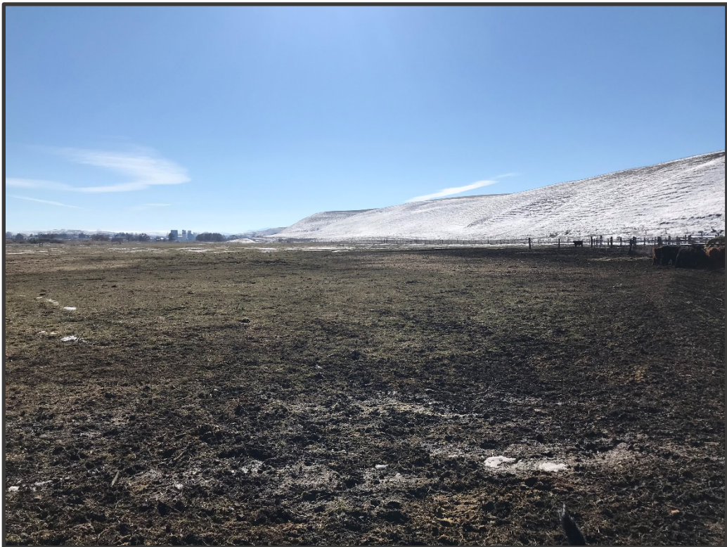
Looking Southeast from origin of SE pipeline.