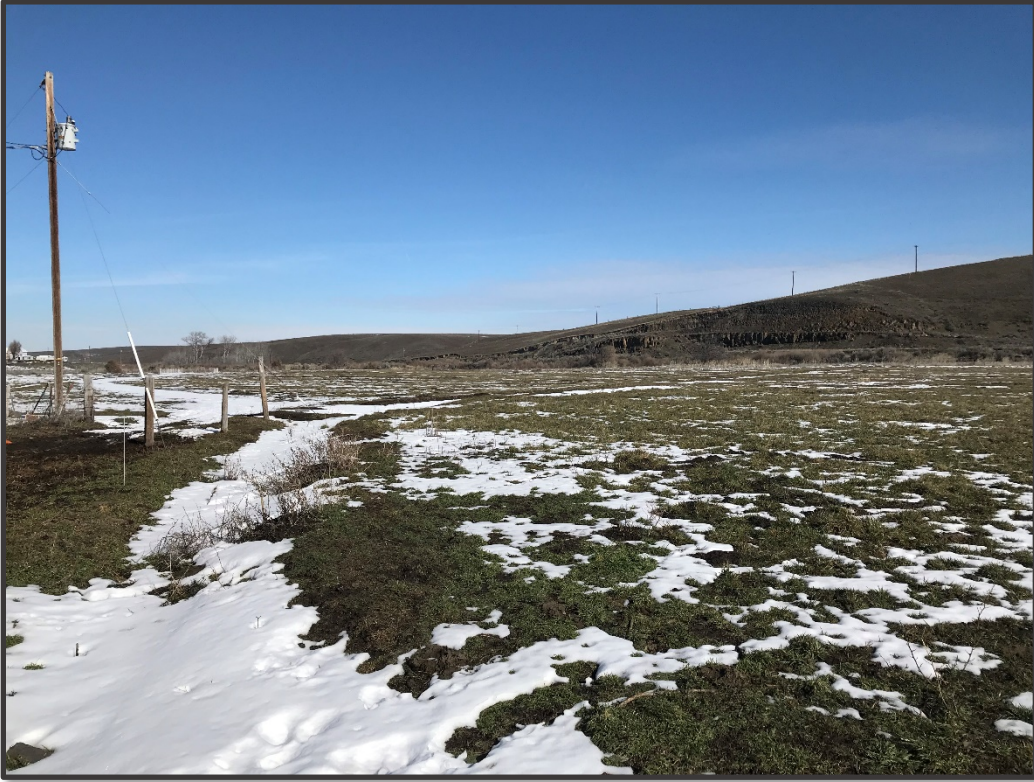
Looking Northwest from origin of NW pipeline.