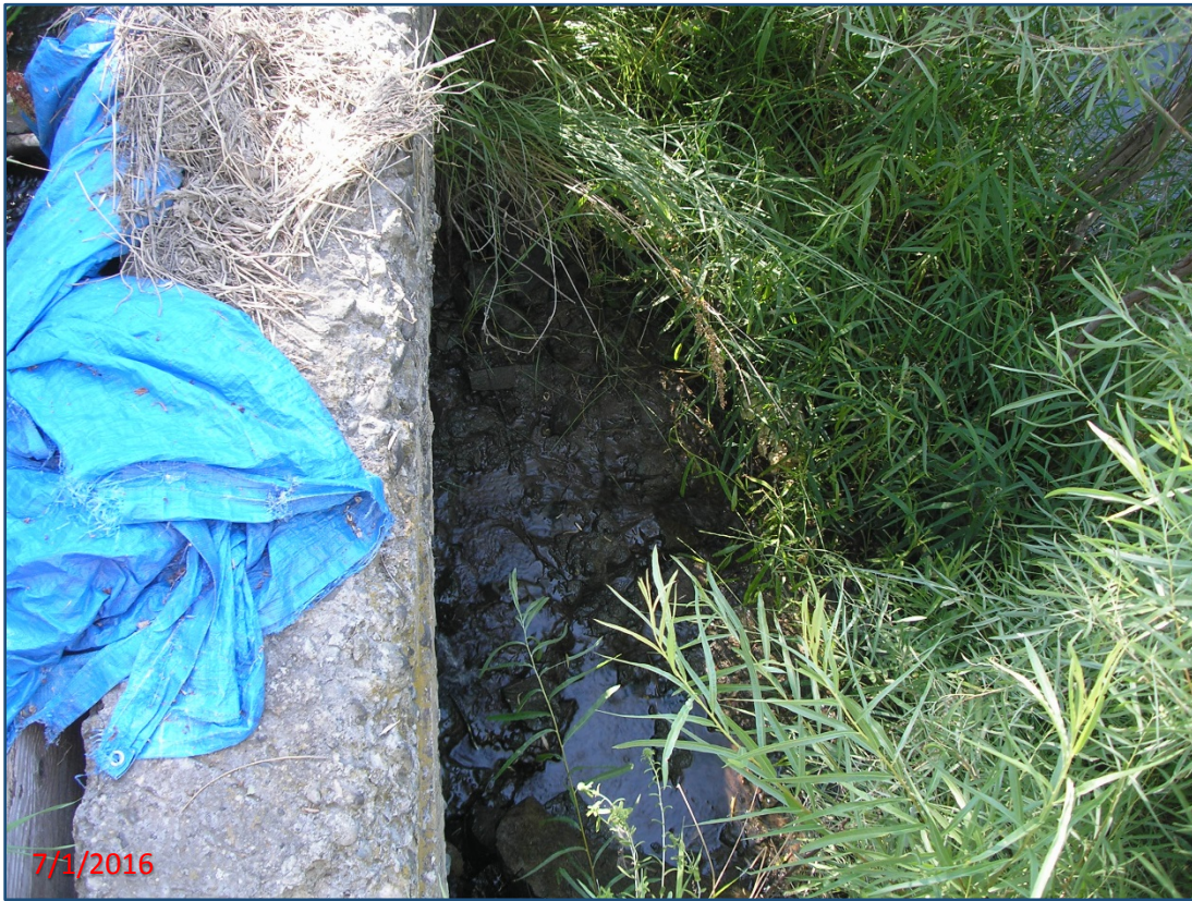
Leaking in concrete ditch near diversion.