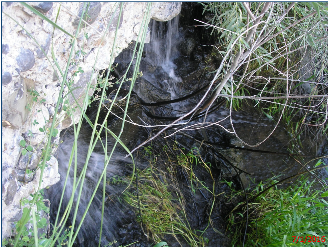
More leaking in concrete ditch.