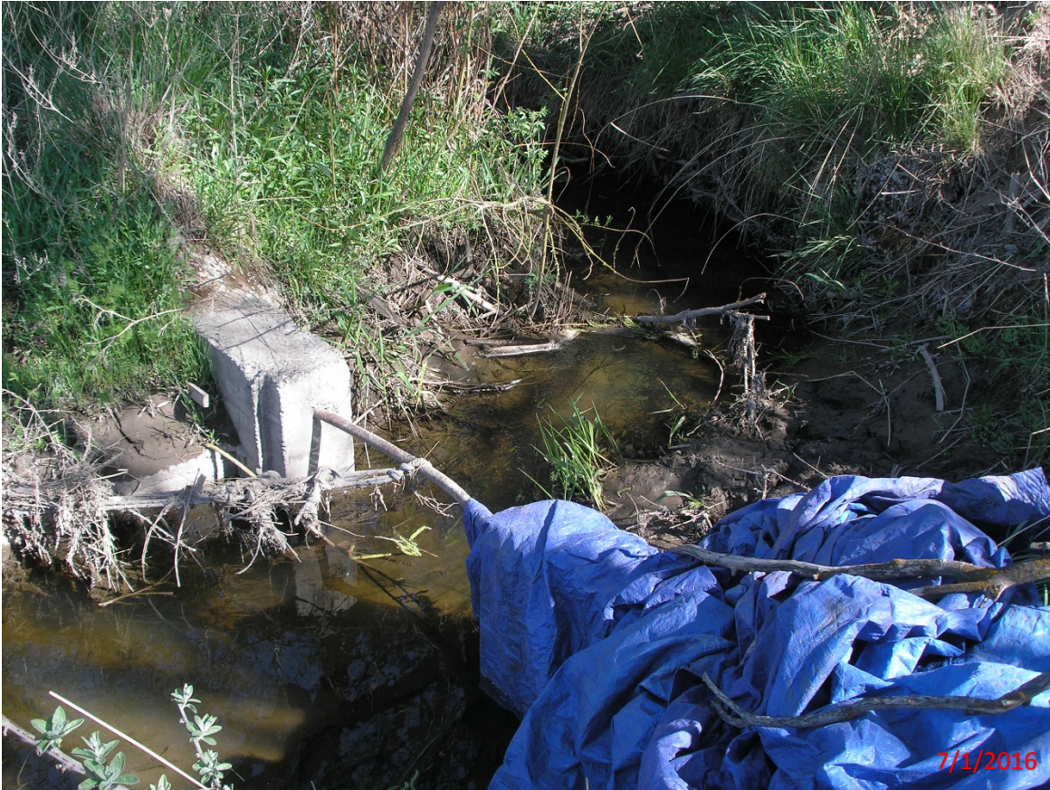
Area where canal gate will be installed.