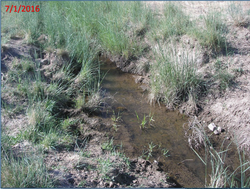
Images of existing ditch that will be piped.